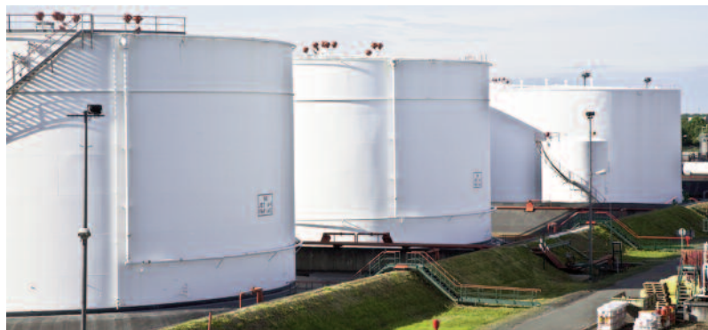
Figure 1. Aboveground storage tanks.

API Standard 653 defines the inspection requirements for external only in-service inspections and internal/external out-of-service